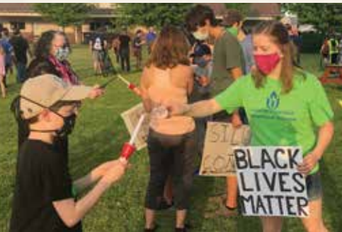
Congregation members stand for justice in downtown Dubuque.