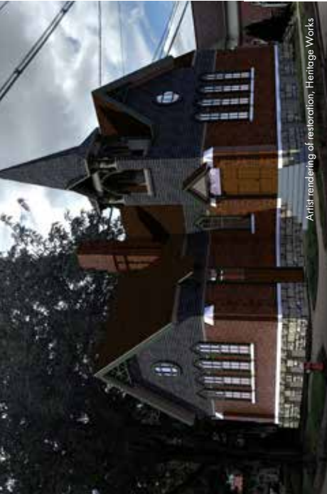
Artist rendering of restoration, Heritage Works

1699 Iowa Street | PO Box 1369 Dubuque, Iowa 52001 uudbq.org | uudmain@gmail.com