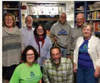
Serving a meal at Catholic Worker House with Temple Beth El.