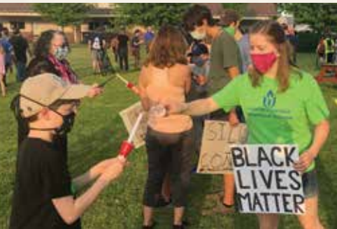
Congregation members stand for justice in downtown Dubuque.