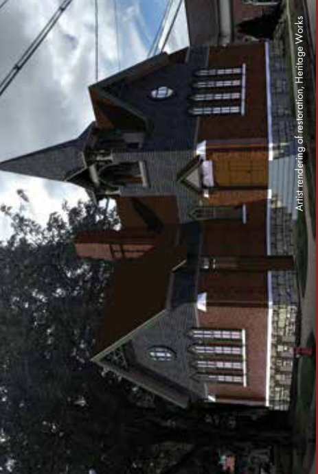
Artist rendering of restoration, Heritage Works

1699 Iowa Street | PO Box 1369 Dubuque, Iowa 52001 uudbq.org | uudmain@gmail.com